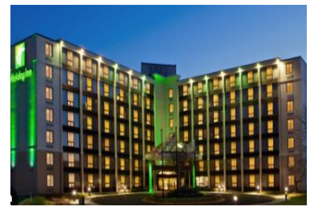
Washington DC Holiday Inn Greenbelt