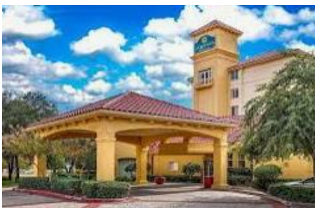
Dallas La Quinta Inn by Wyndham Dallas Uptown

REMINDER: Apply for ESTA no later than 72 hours before departing for the United States. Real-time approvals will no longer be available and arriving at the airport without a previously approved ESTA will likely result in being denied boarding.