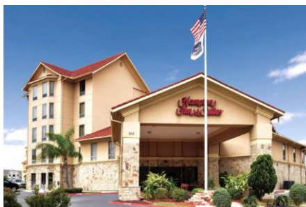
Houston Hampton Inn & Suites